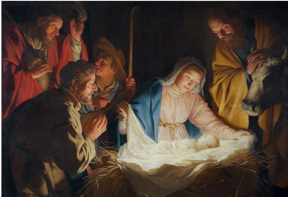
Adoration of the Shepherds, 1622, by Gerard van Honthorst