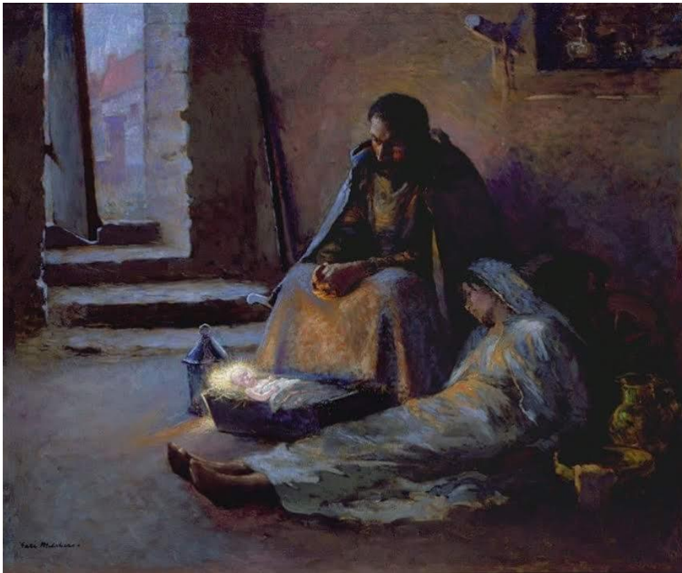
Nativity, 1891 by Julius Garibaldi "Gari" Melchers.

The painting above is one of the images I have been praying with this Advent. Although the title of the painting is Nativity, it portrays the scene of Nativity quite differently from what we might be used to. There is no bright star in a magical starry night, there are no animals or shepherds. It is a dark, unheated, cold room where even the door can't be shut fully to keep the cold wind out. Mary looks utterly spent and exhausted after what must have been a very long journey to get there followed by the intense hours of labour to give birth. Joseph looks very quiet and no doubt is exhausted mentally and emotionally. And yet his eyes are fixed on the baby. Then there is baby Jesus covered in hay,